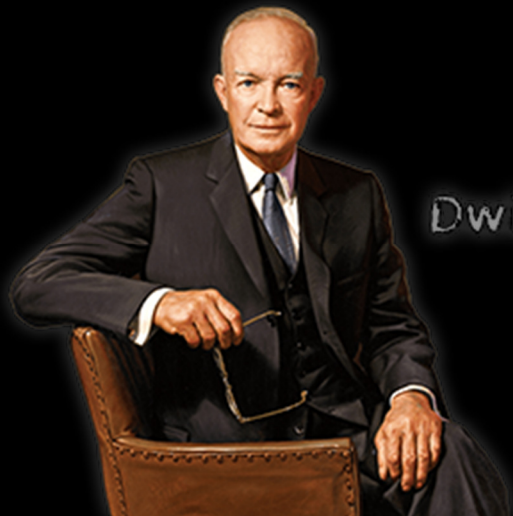
Dwight Eisenhower 1953

This world in arms is not spending money alone. It is spending the sweat of its laborers, the genius of its scientists, the hopes of its children. This is not a way of life at all in any true sense. Under the clouds of war, it is humanity hanging on a cross of iron."