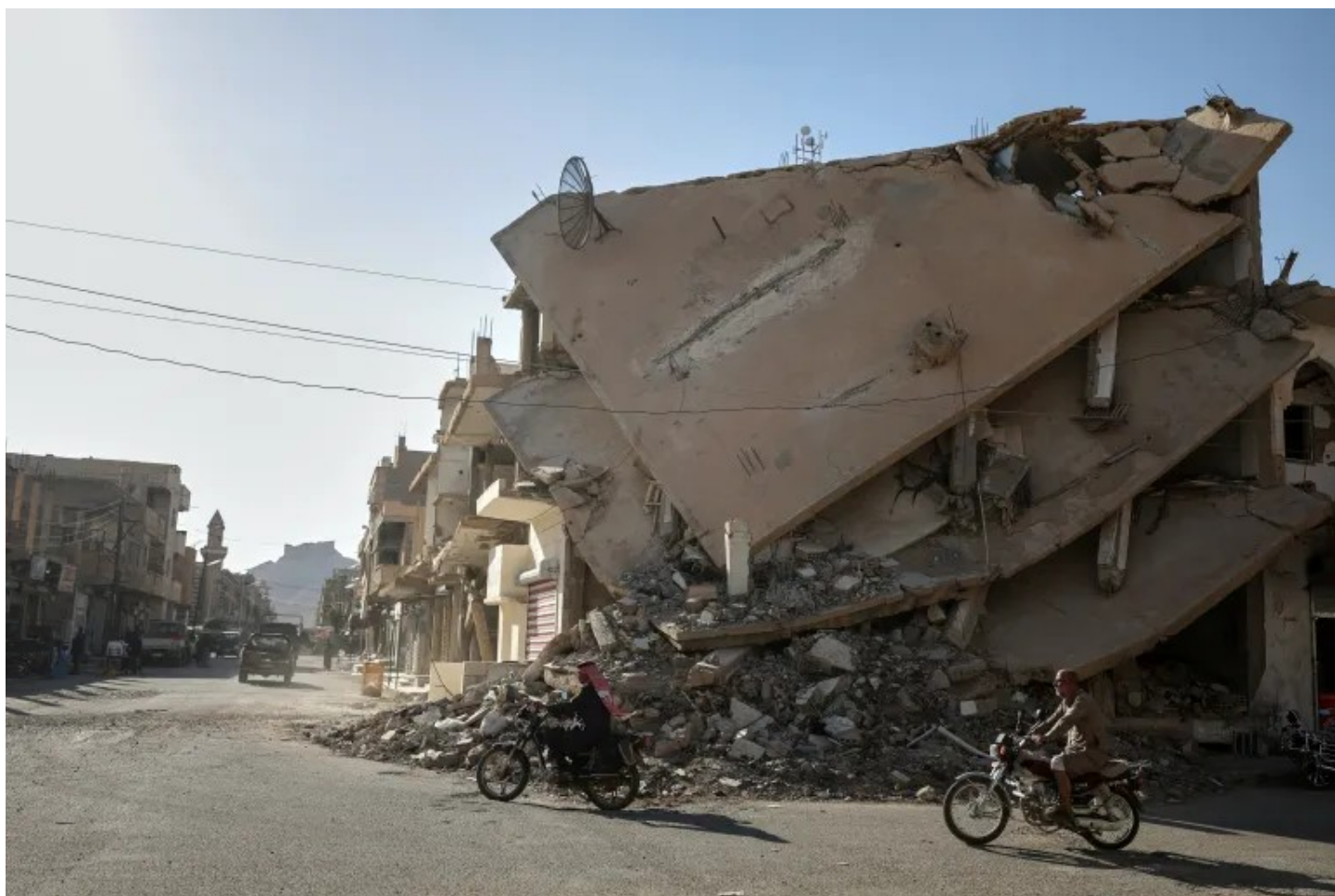
Residents ride a motorcycle along a war-damaged street in Palmyra, Syria

US Central Command says lone gunman was 'engaged and killed' after launching attack in central Syria.