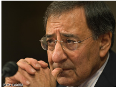
CIA Director Leon Panetta says secret prisons used to detain terror suspects have been closed.

WASHINGTON (CNN) -- CIA Director Leon Panetta has carried through on his pledge to prohibit independent contractors from conducting interrogations of terror suspects.