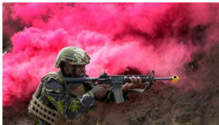
Clouds, crowns and crews: Africa's top shots