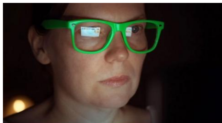
The employees secretly using ChatGPT