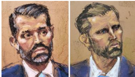
Trump's sons a study in contrasts in court showdown