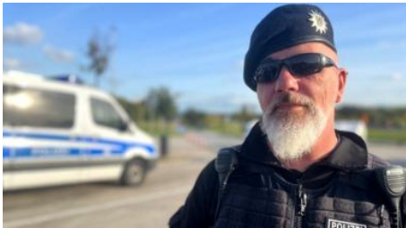
Germany's migrant row deepens as illegal arrivals soar