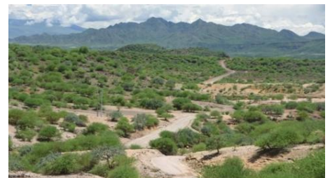
Africa's safari trail with no tourists