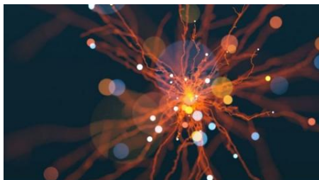
Why aliens may be weirder than we think