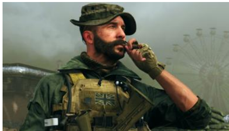
Can Call of Duty last another 20 years?