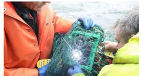
Tech promises to remove the guesswork from fishing