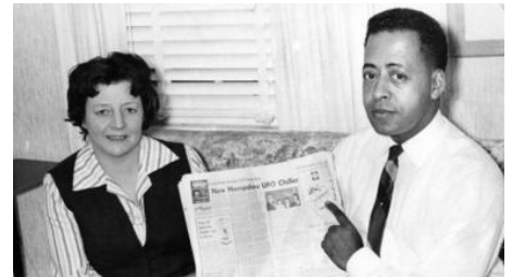
The UFC fighter whose family are part of UFO folklore