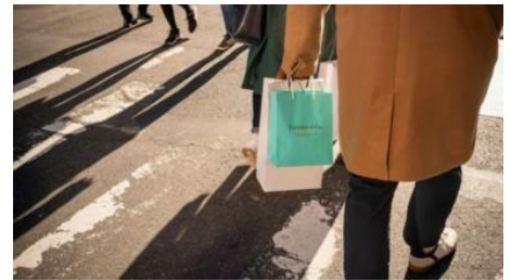
Why holiday shopping may surge