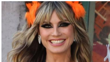
Weekly quiz: What did Heidi Klum dress as for Halloween?